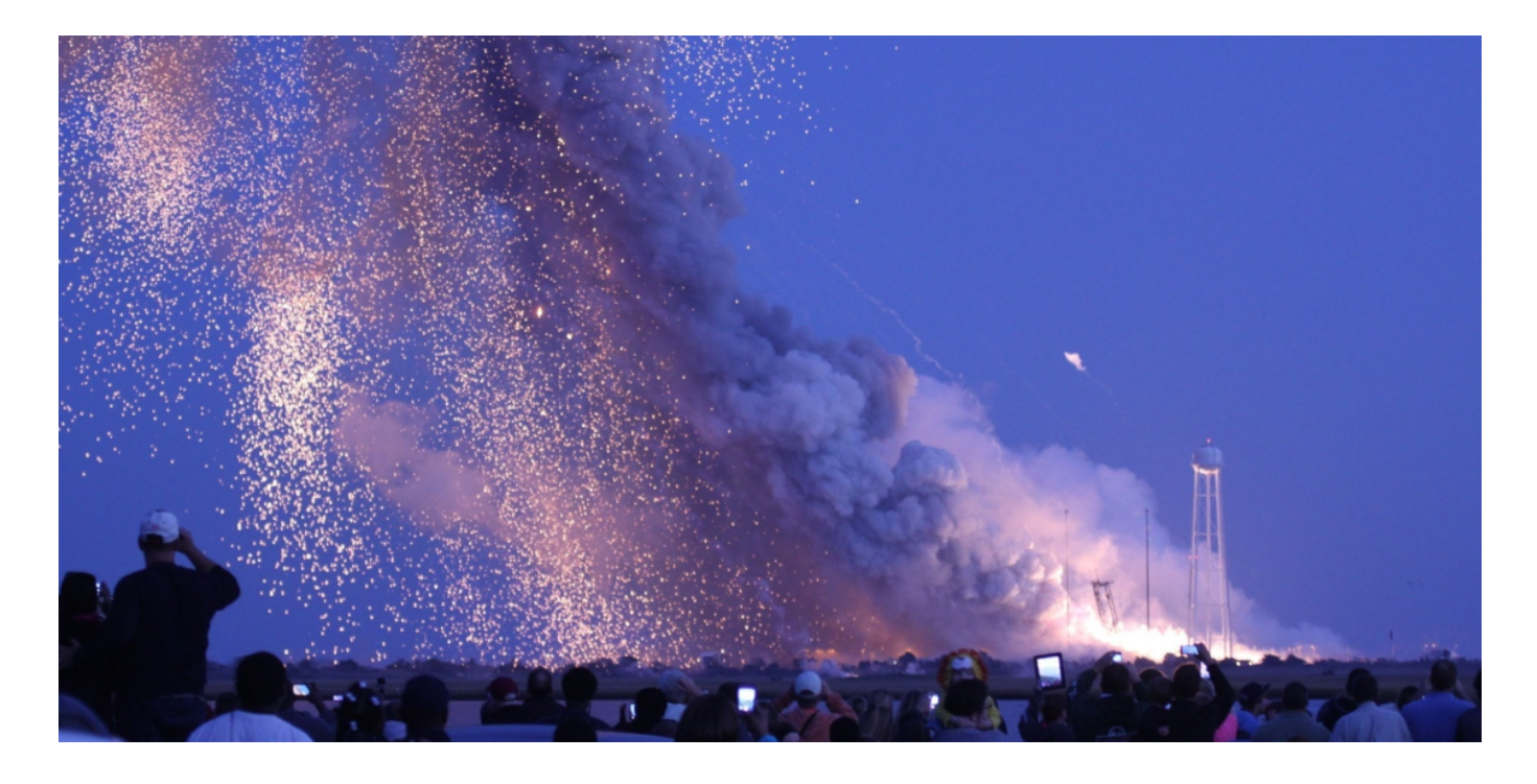
Antares Rocket Explosion